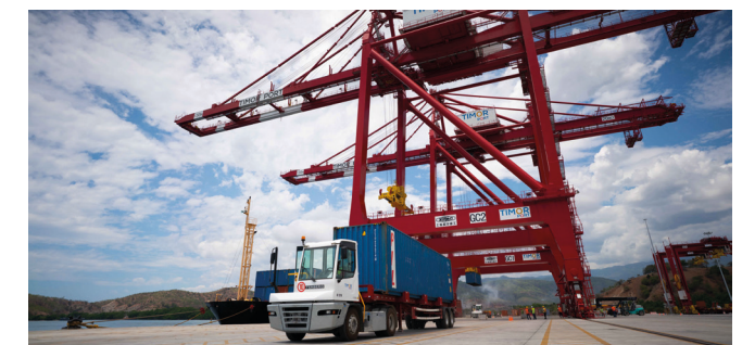
Olivier De Noray PORTS & TERMINALS CEO

In Timor Leste, where AGL started the activities of the Tibar Bay deepwater port in 2022, environmental studies initiated with the assistance of the World Bank have served to determine the offsetting measures to be implemented in order to restore an area of mangrove while increasing its surface area and preserving marine fauna by setting up a hatchery to protect turtles. In 2019, this project was voted the best public-private partnership in Asia-Pacific by IJGlobal.